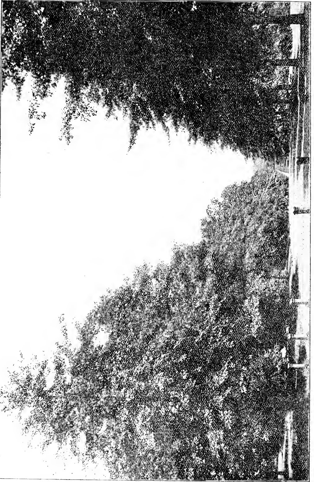
AVENUE OF PIN OAKS IN FAIRMOUNT PARK, PHILADELPHIA, PLANTED IN 1876. THIS IS CONSIDERED ONE OF THE FINEST AVENUES IN THE PARK.